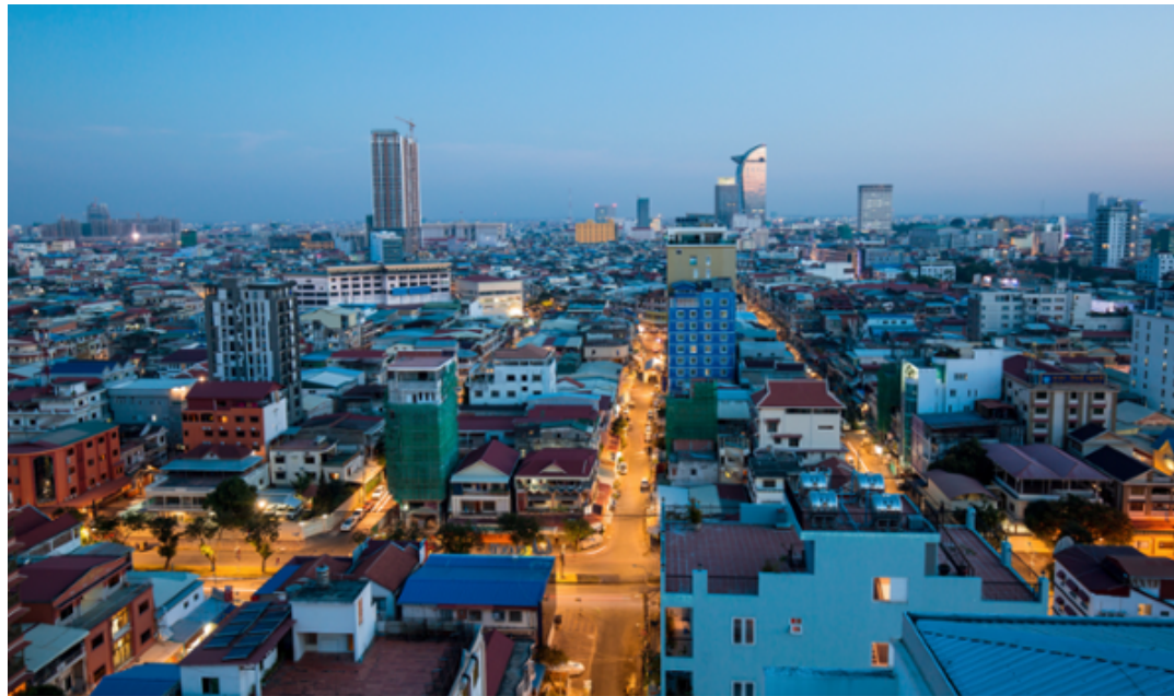
Phnom Penh Landscape

The Ministry of Economic and Finance sets out 9 recommendations as the direction for the General Department of Taxation to implement more efficient revenue collection in 2022: