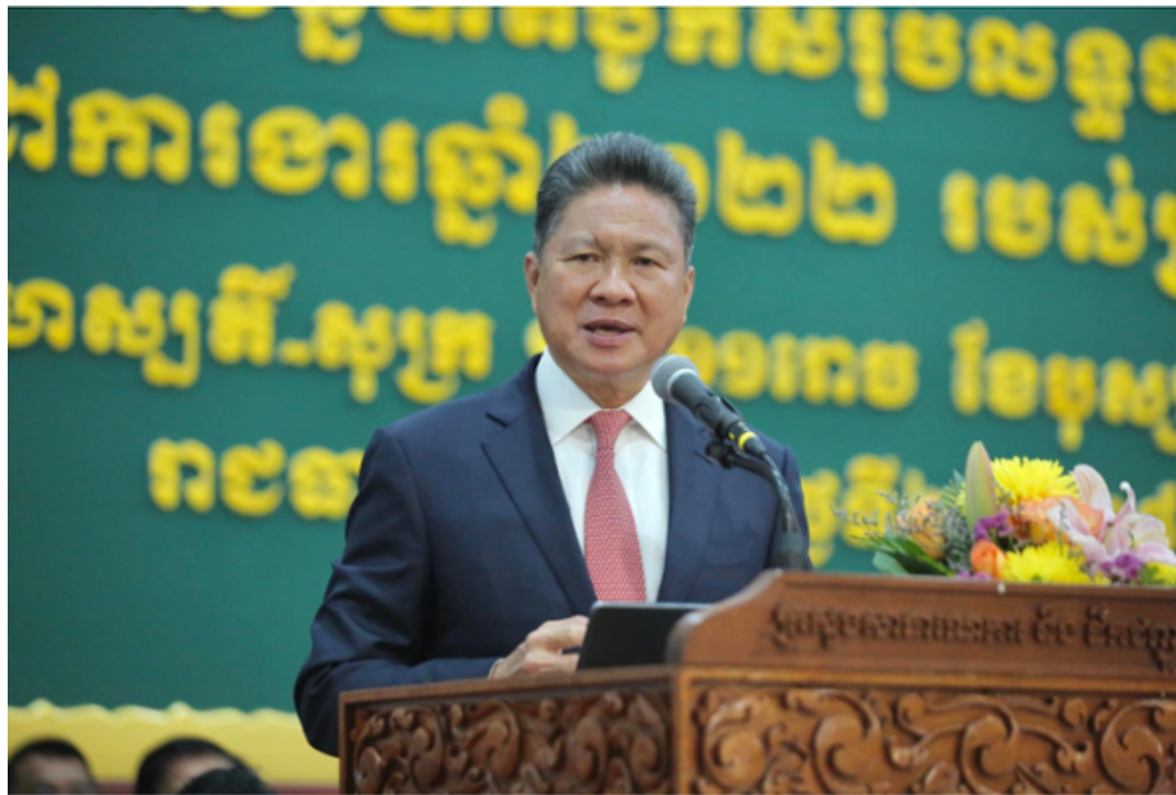
H.E. Sun Chanthol, Senior Minister, Minister of Public Works and Transport

On Thursday, January 27, 2022, the Ministry of Public Works and Transport reviewed the achievements of 2021 and work direction 2022 with government officials at the main hall of the Ministry. This year's conference was organized under the theme: " Improving Climate Resilient Transport Infrastructure, Management of Road Construction and Quality Maintenance with a Focus on Modern Technology " with the aim of reviewing work progress, discussion, and exchanging views.