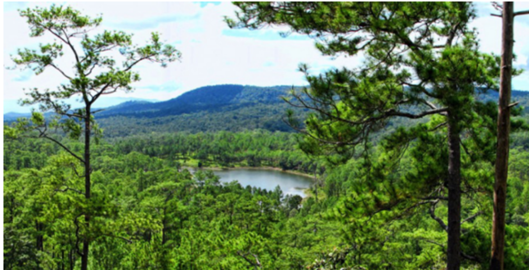
Kirirom National Park

C ambodia is the first nation in Southeast Asia to share a detailed roadmap with the United Nations Convention on Climate Change (UNFCCC) on the measures it will initiate to achieve carbon neutrality by 2050.