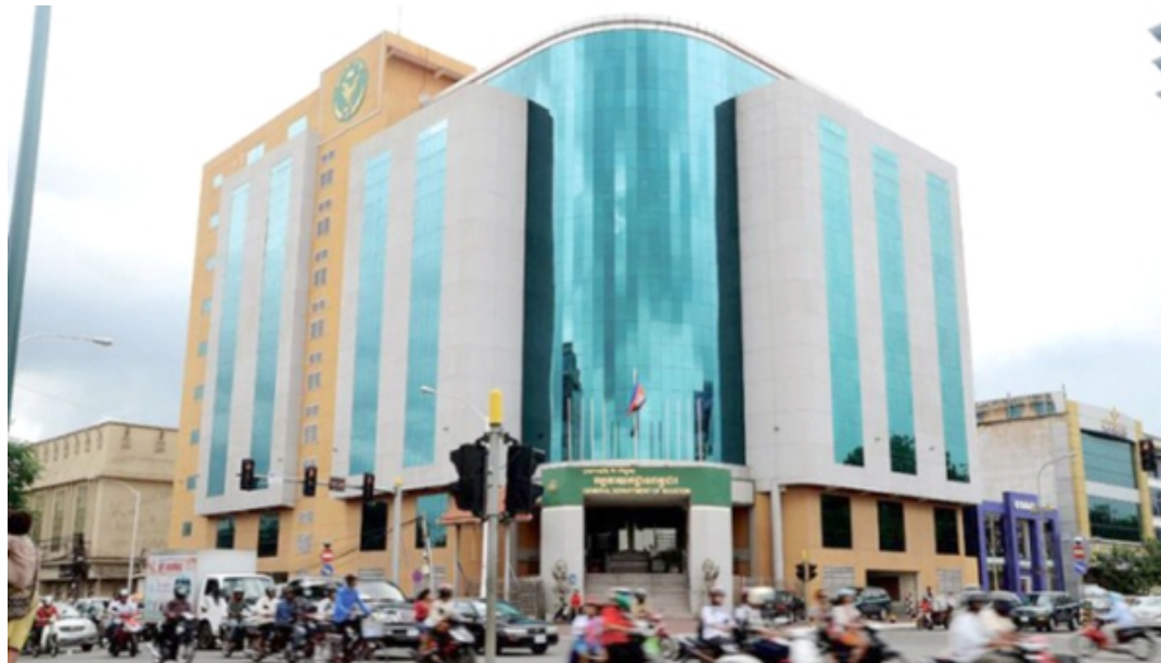
General Department of Taxation Phnom Penh, Cambodia

On 24 February, the General Department of Taxation released a notification to