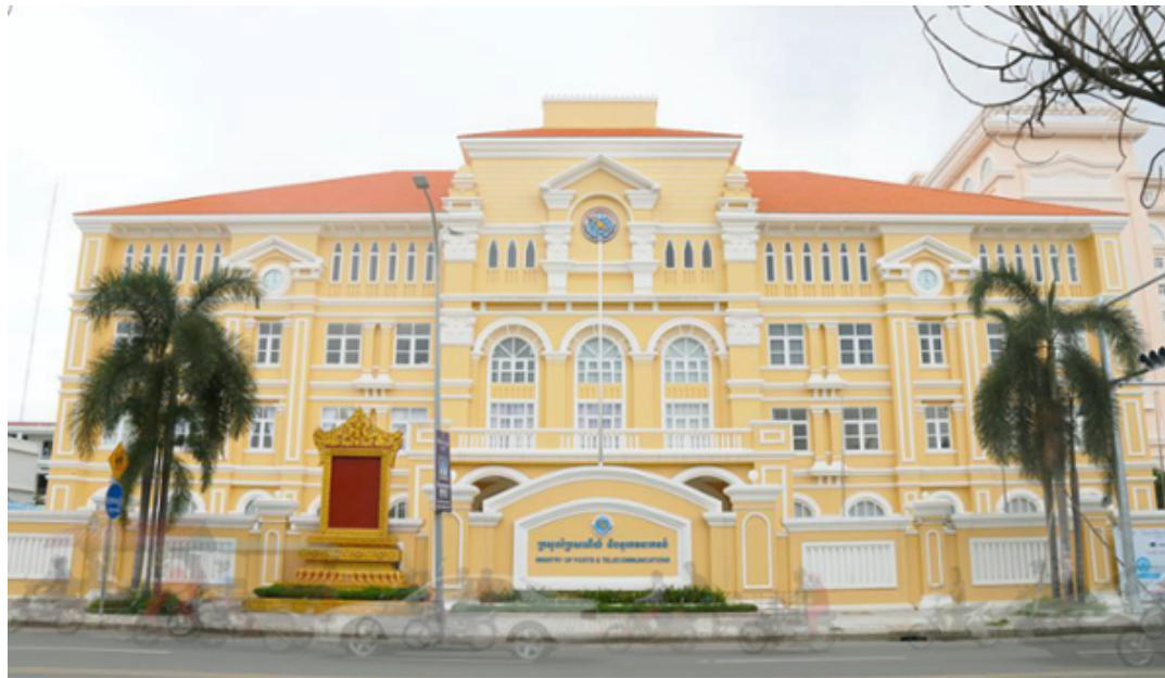
Ministry of Post and Telecommunication, Phnom Penh, Cambodia

The Ministry of Posts and Telecommunications has established the "Digital Community of Cambodia" system to bring together qualified individuals in the digital technology, both domestically and internationally, to sign up for the system for opportunities to develop their professional skills, good employment opportunities, sharing experiences and important information related to policies in the field of information and communication technology.