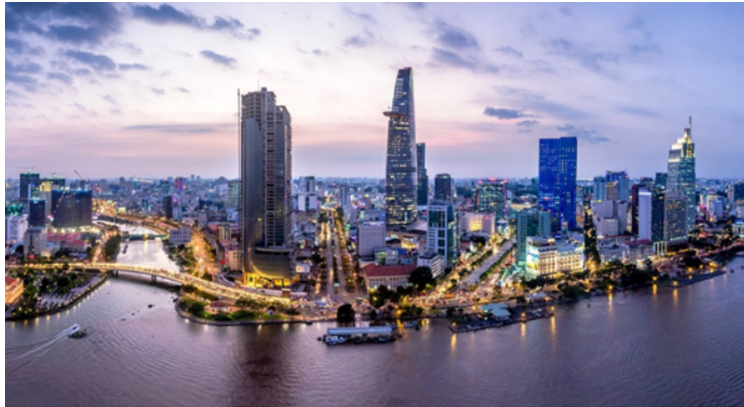
Top View of Ho Chi Minh City, Vietnam

B ased on the Business Climate Index (BCI) from the European Chamber of Commerce in Vietnam, European companies are more positive and optimistic about Vietnam's trade and investment environment following the end of lockdown.