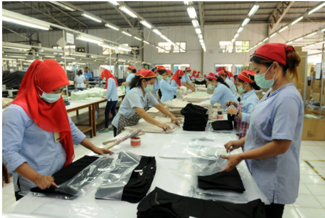
Factory workers in the garment sector, Myanmar

E uroCham Myanmar's Garment Advocacy Group (GAG) has published the Garments' Sector Factsheet to inform the stakeholders' debate about the current and the future of the garments sector in the country. This factsheet also used to update stakeholders on the state of the sector due to COVID and the military's declaration of a state of emergency on 1 February 2021.