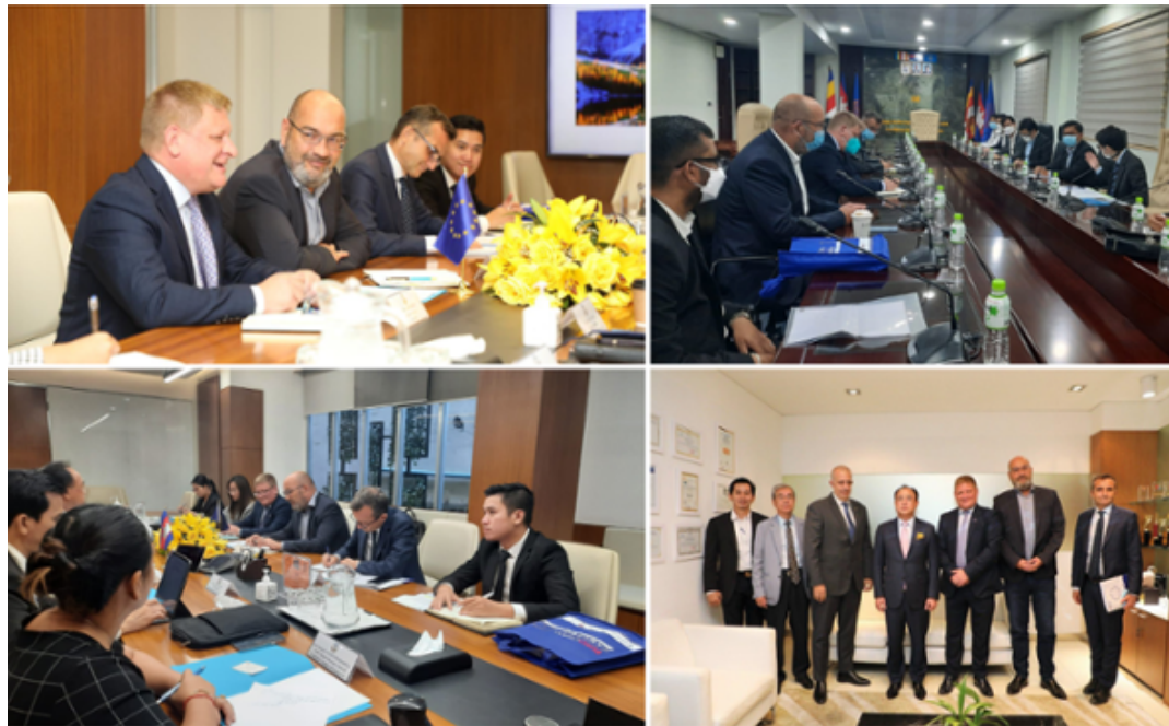
EU-ASEAN Business Council Visit to Cambodia