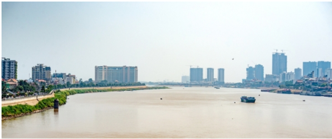
Mekong river Phnom Penh, Cambodia

The General Department of Taxation has introduced the Online Tax Filing (E-Filing) in accordance with instruction No. 003 dated 27 February 2020 of the Ministry of Economic and Finance. In addition, the General Department of Taxation has received a number of requests to resolve the issue of changing tax payment status. The GDT will review the documents requesting to change the status of tax payment on the date of tax payment on tax receipt and date of application for payment and monthly tax return online.