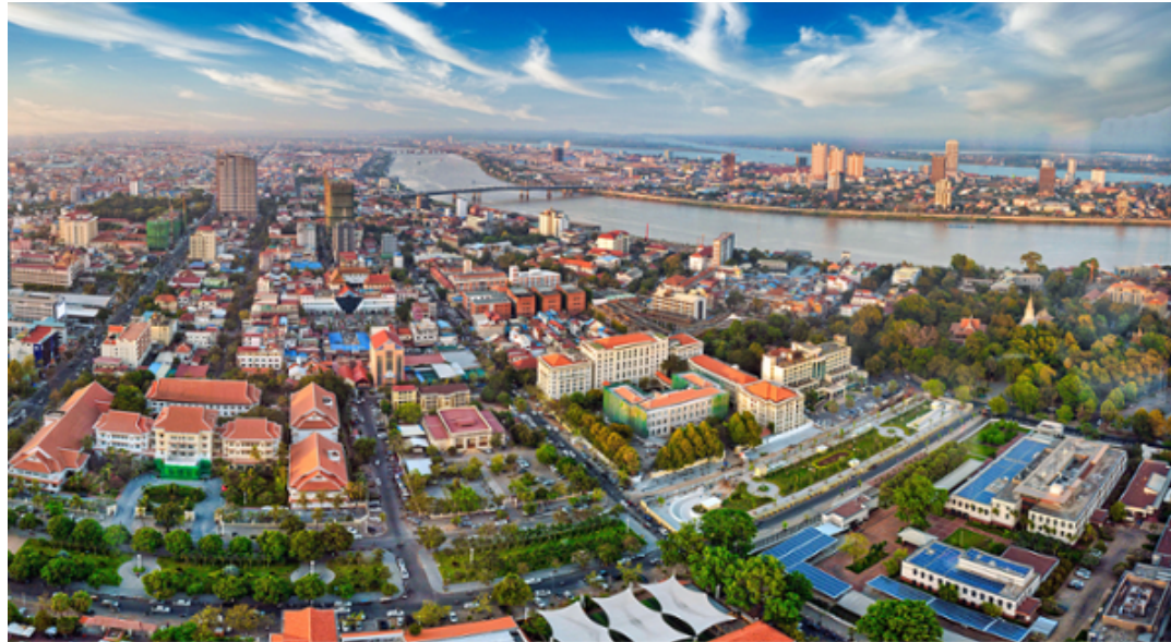
Phnom Penh City

The UN's latest evaluation of Cambodia states that Cambodia has fulfilled the three basic criteria necessary for graduation from the least developed country (LDC) status, including GDP per capita of $1,377 which surpasses the $1,222 threshold; the Human Assets Index at 74.3 which is higher than the requirement of 66; and an Economic and Environment Vulnerable Index of 30.6 which is lower than the requirement of at least 32.